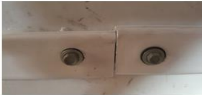
Damage from misaligned connectors.