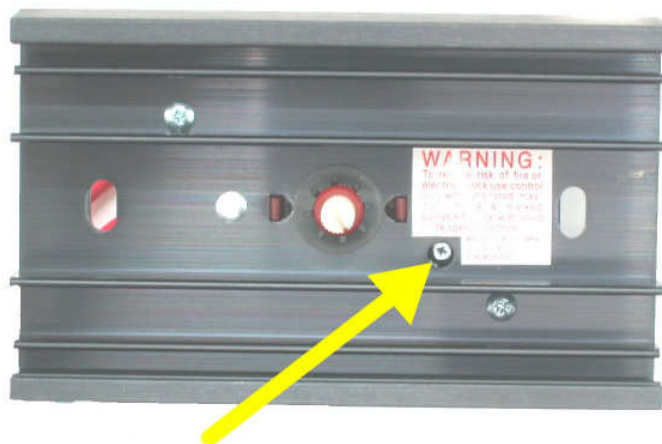
Minimum Speed Adjustment

The minimum speed adjustment knob (shown above) allows you to set the RPM of the fan at the lowest setting on the controls dial. It should be used to raise the minimum speed if the fan overheats or appears to be running at less than 30% of the highest speed at the current minimum setting. It can also be used to lower the minimum setting if you do not notice a significant difference in airflow when turning the dial all the way from high to low. The adjustment knob setting can be changed by inserting a slotted screwdriver into the opening.